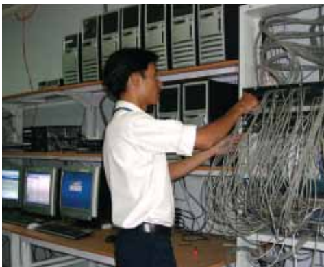
NTS uses the latest technology to verify the compatibility, functionality and compliance of your products.