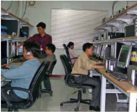
Technology, skills, and experience to test all of your technology products.