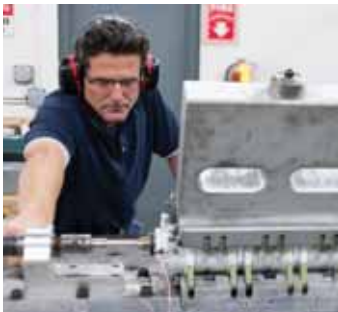
NTS's Subject Matter Experts are skilled design engineers to ensure your product's success