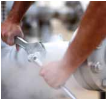
NTS is your single resource to help you face today's challenges