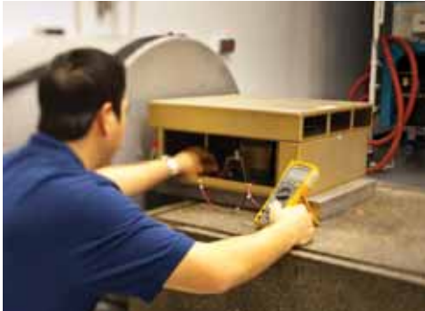
Our expert Test Engineers and Technicians are available to conduct test programs and more