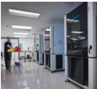
NTS offers various testing environments to certify your product's performance and reliability