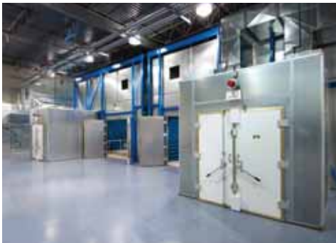
NTS's 50 years of success is contributed to our growth which is reflected by the recent addition of a 85,000SF facility in Rockford, IL