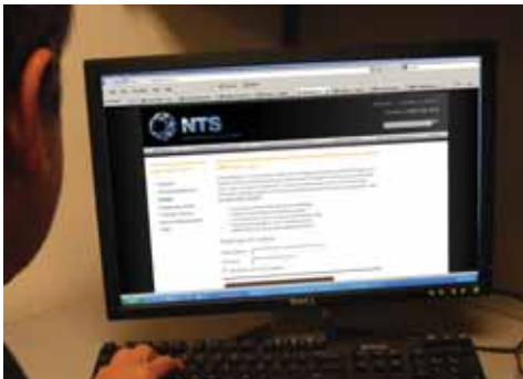
LabInsight provides easy on-line access to reports and real-time witness testing