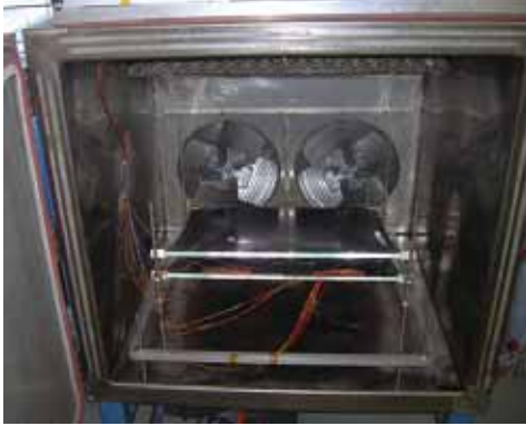
Low Oxygen Atmosphere Chamber