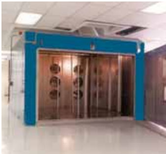
Thermal Cycling Chamber