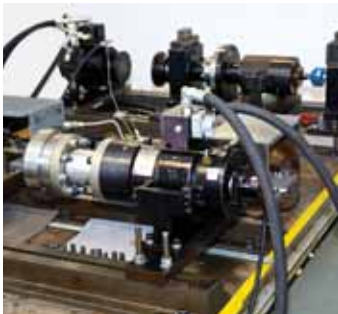
Rotary and Linear Servo-Hydraulics