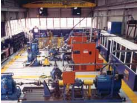
5,000 sq-ft Dyno Lab High Bay with 10 ton Crane