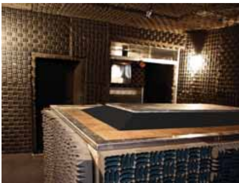
Combined Vibration, Temperature and Sound Test Chamber