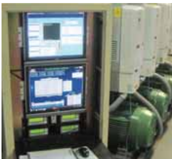
Custom Measurement and Control System