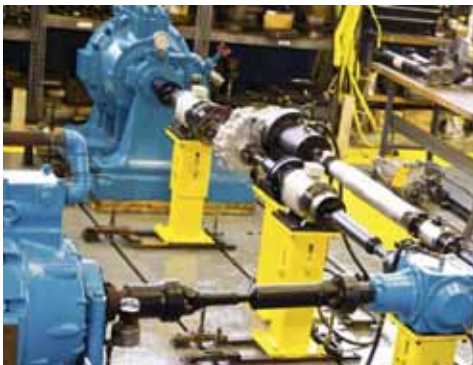
eTransmission Dyno Test Setup