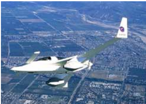
Flight testing of particulate sampling pod