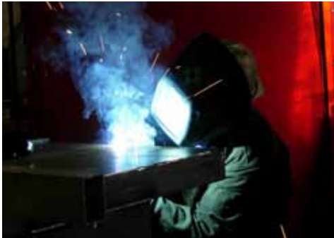
Welding an industrial processing machine